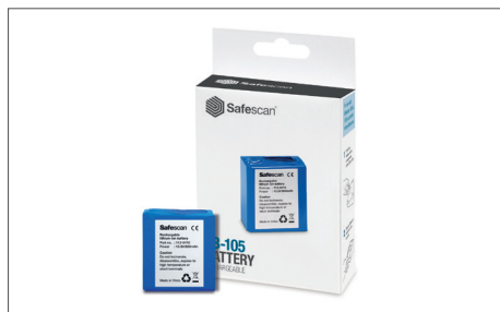
Safescan LB-105 Rechargeable battery Art. no: 112-0410