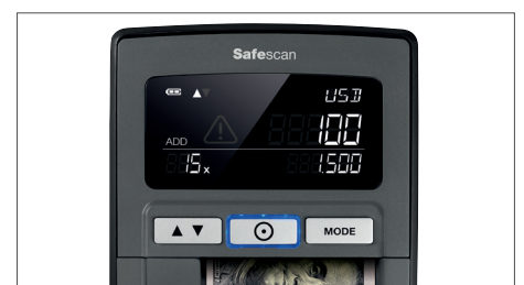
Shows quantity and value of the scanned bills