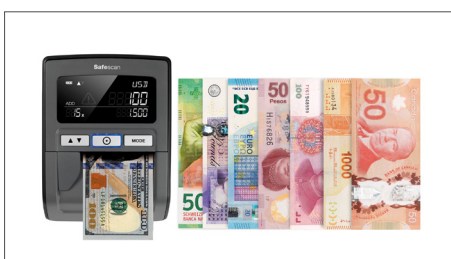
Verifies 8 currencies in all directions