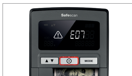
Visible and audible counterfeit banknote alarm